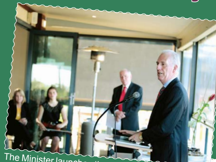
The Minister launches the book