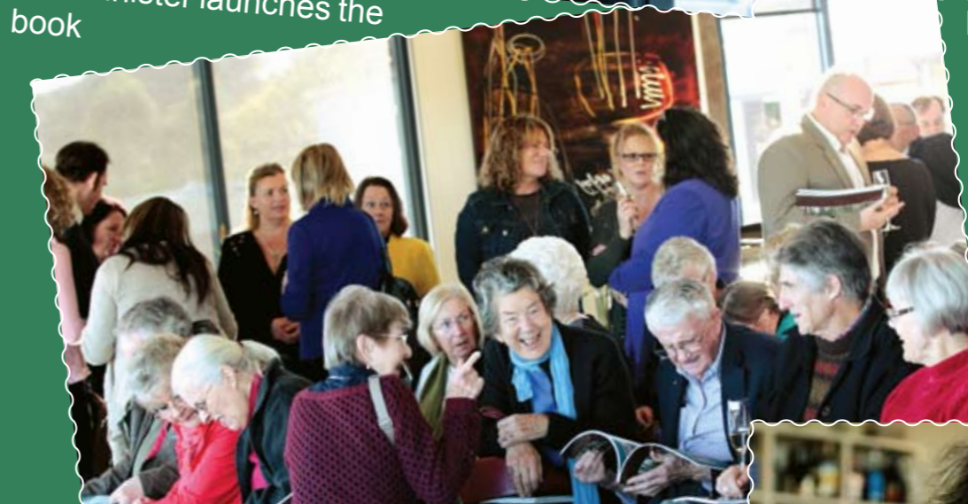
Families catching up